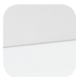
Metallic Pearl White

* On all Apex models invisible magnetic grille fixing provides clean visual styling when used with the grille off, excluding the AW-12. E&OE. All colours approximate.